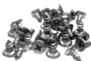
CROSS RECESS (PHILLIPS)