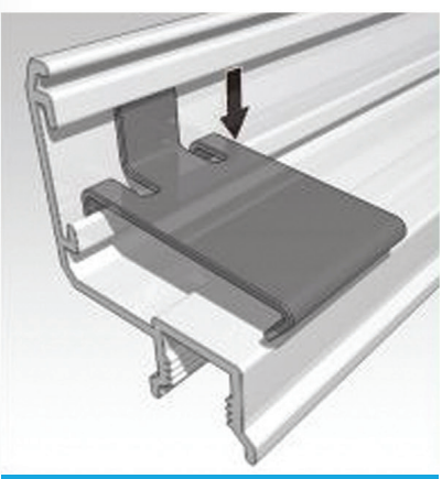
STEP THREE: Lift and insert second small leg down into lower channel