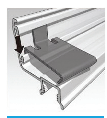
STEPTWO: Insert one small leg down into lower channel