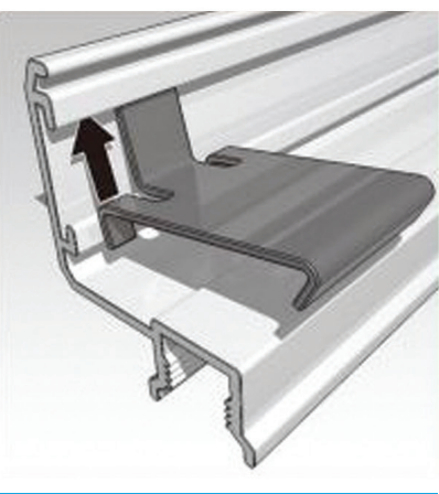
Insert main centre leg into upper channel